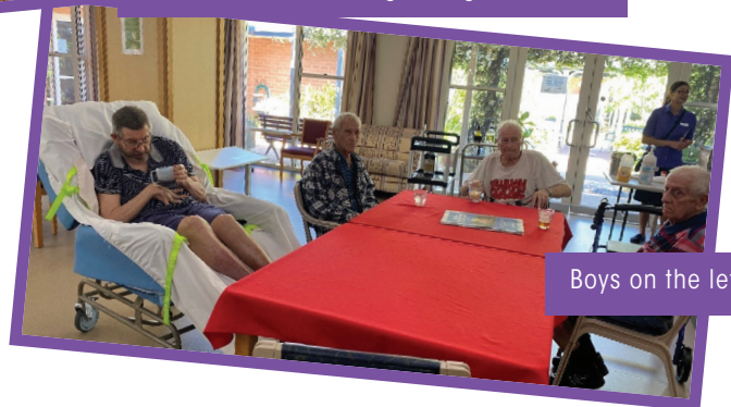
Boys on the left, ladies on the right.....