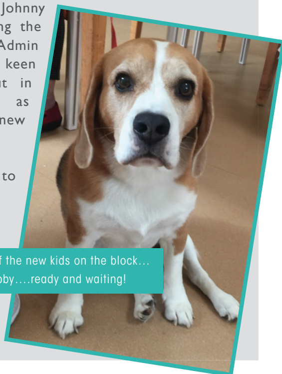
One of the new kids on the block... Toby....ready and waiting!