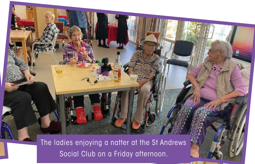
The ladies enjoying a natter at the St Andrews Social Club on a Friday afternoon.